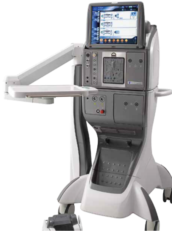
Constellation Phacoemulsification machine

We at Agrawal eye hospital do most of our cataract surgeries under topical anaesthesia that is without an injectable anaesthetic. The surgeries are done using Constellation Phacoemulsification machine by Alcon. The constellation machine uses ozil technology to emulsify and remove the cataract. After removal of the cataract, a foldable lens is implanted through a self-sealing sub 2.2 millimetre incision.